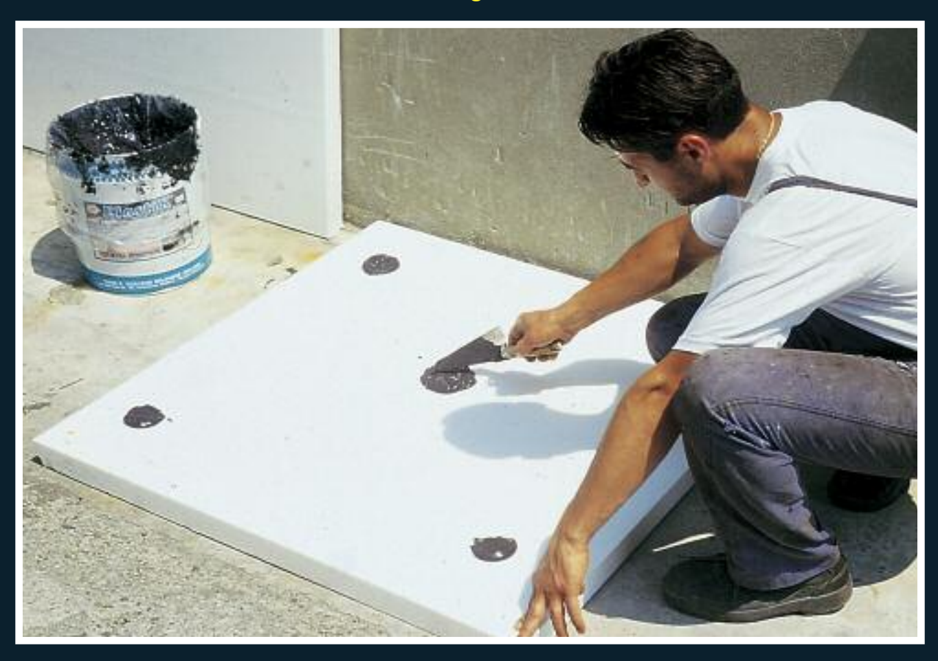
To fix insulated panels to breathable surfaces (ex. concrete, wood)