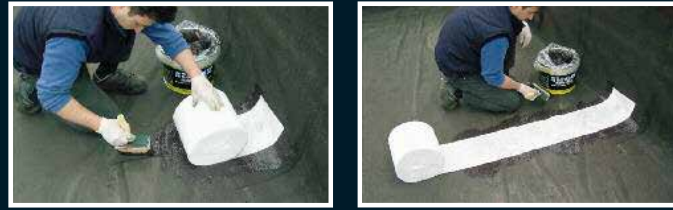
Use ElastiK to apply the Supporto Antifessura (150 g/m<sup>2</sup> polyester non-woven fabric, 25 cm wide roll) to the central area of the crack to repair.

For further information, please call our Technical Office on (+39)02.98280913.