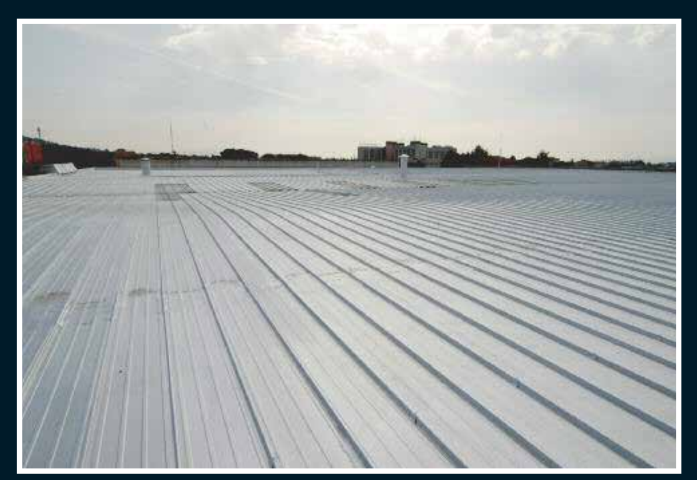
How the metal roof looked like after treating it with two coats of ElastiK applied 48 hours apart (spray-painting, 1 kg/m<sup>2</sup>)

How the metal roofs looked like after treating it with one coat of aluminium paint like Allumisol 12/14, applied 20 days after the second coat of ElastiK (spray-painting, 200 g/m<sup>2</sup>)