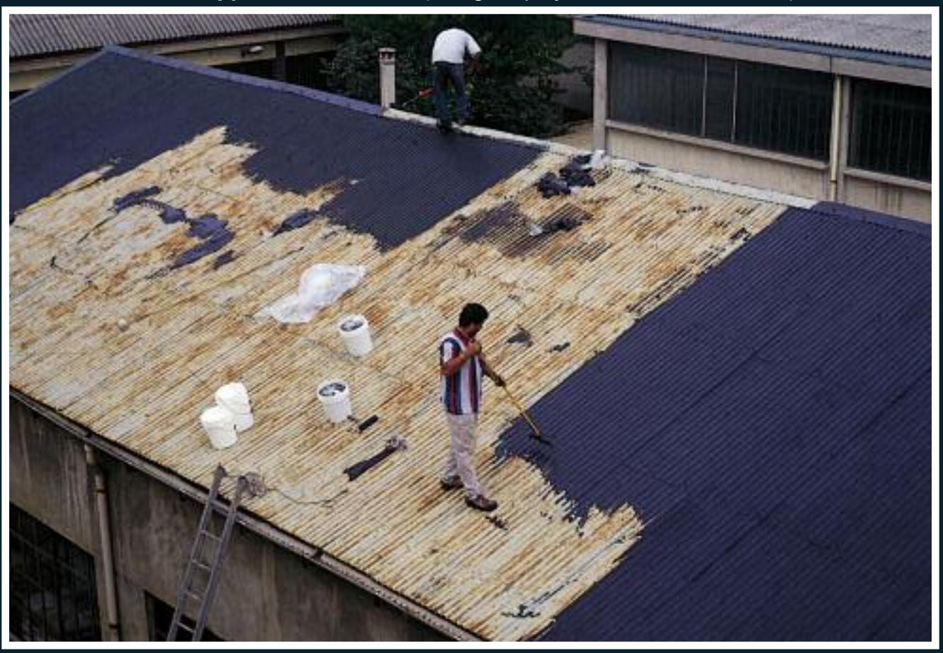
To waterproof old metal roofs and protect them against rust