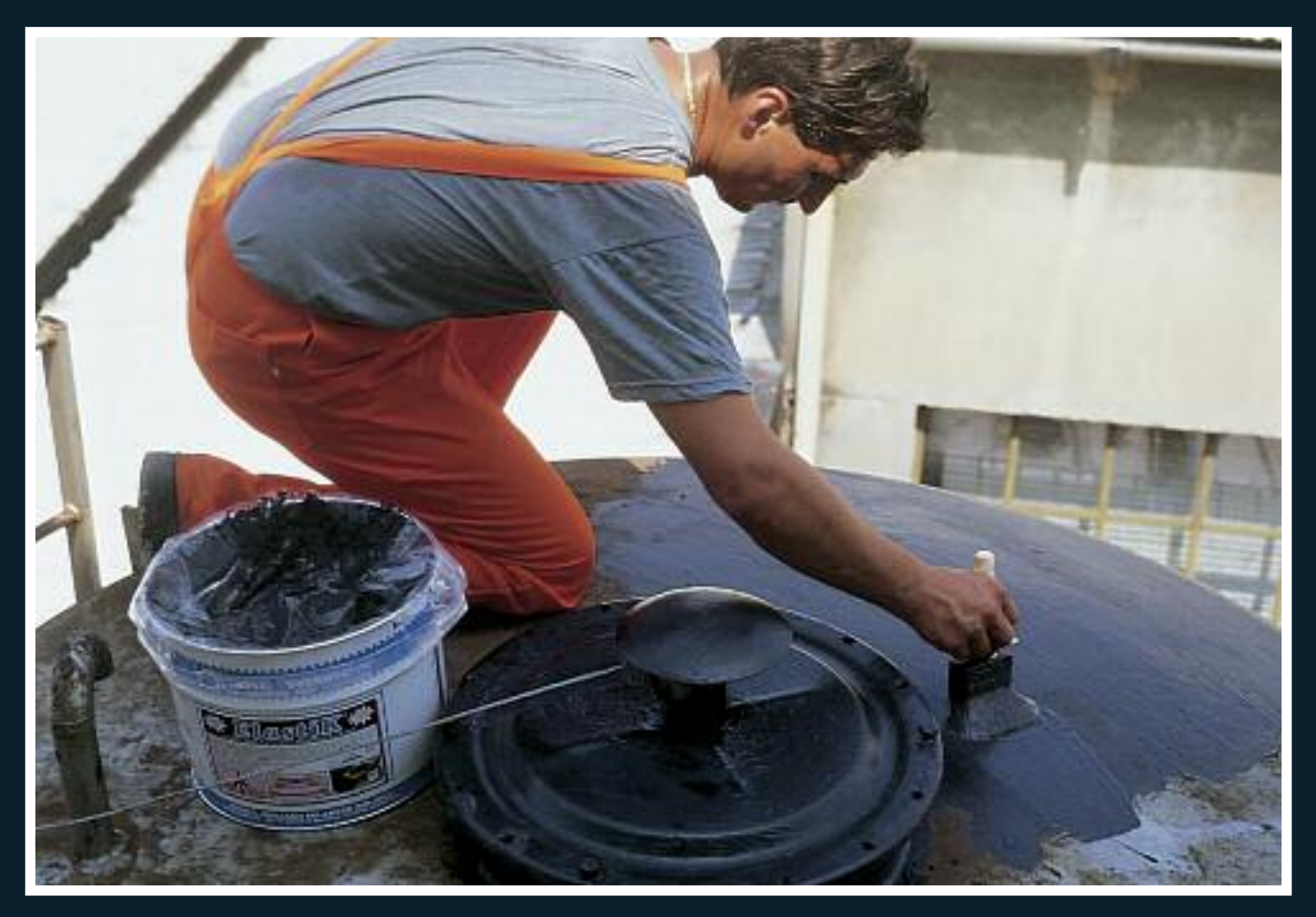
To waterproof all metal surfaces and protect them against rust