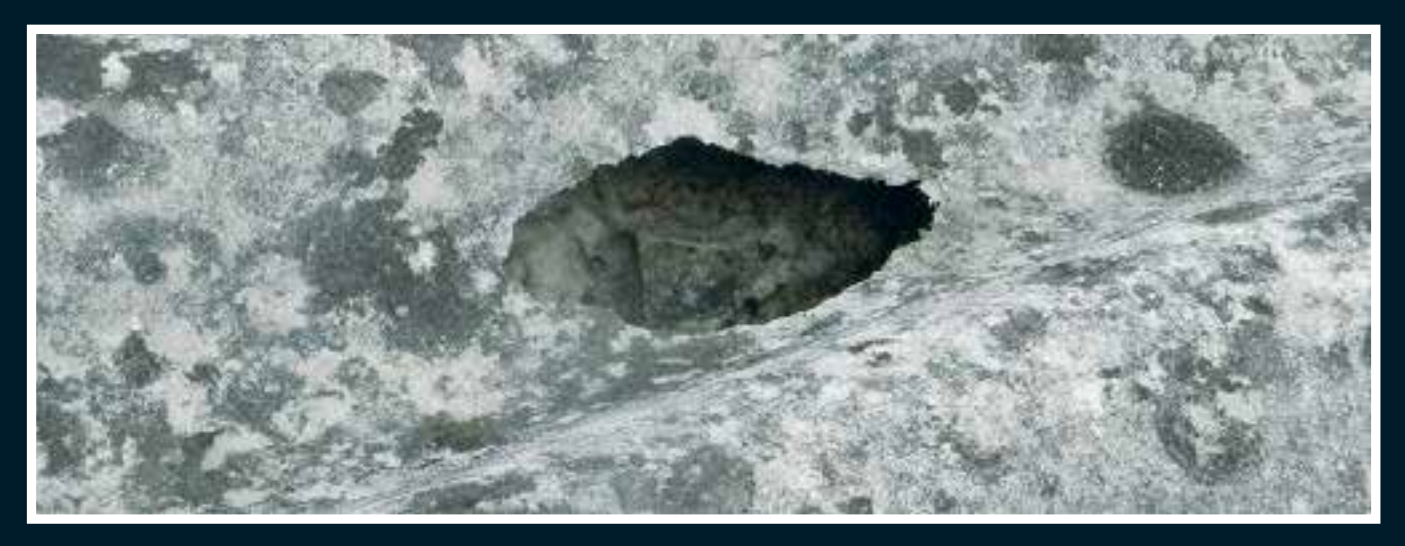
A fibre cement cover clearly broken by hail