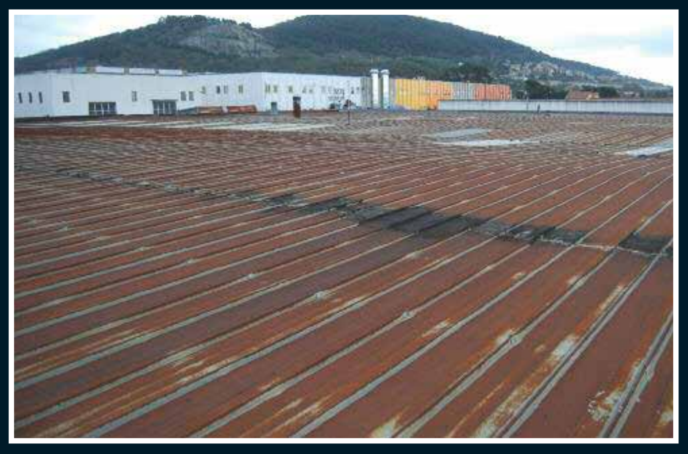
How the metal roof (about 7,000 m<sup>2</sup>) looked like before refurbishing