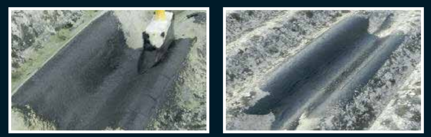
After at least 24 hours, apply the second layer of ElastiK