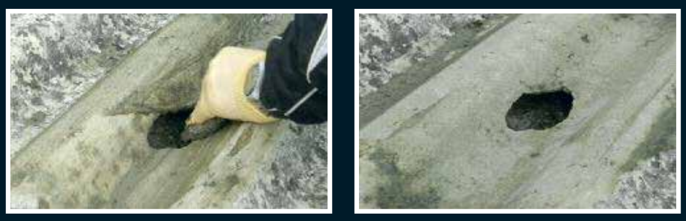
Clean well using wire wool to remove dirt, mould and any parts coming off