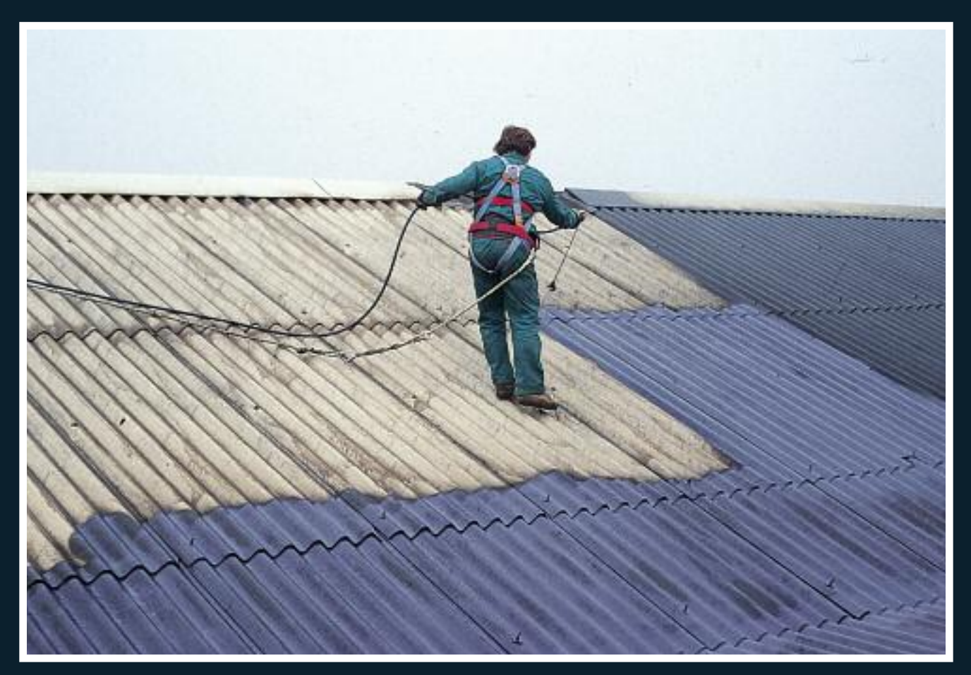
To spray-paint (Airless-style) large surfaces