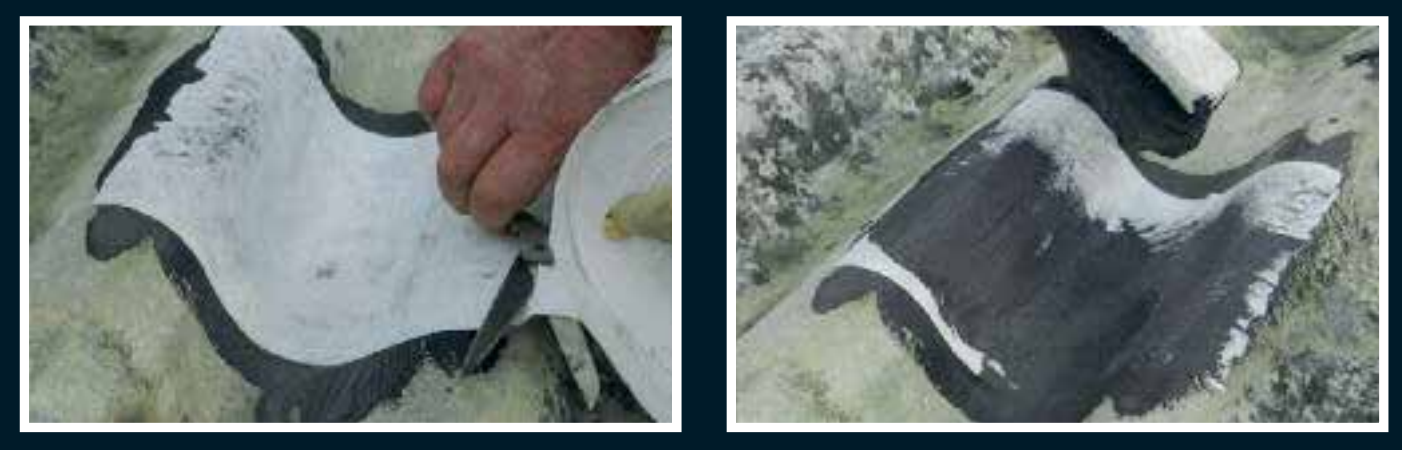
After applying the polyester non-woven fabric, apply the first layer of ElastiK