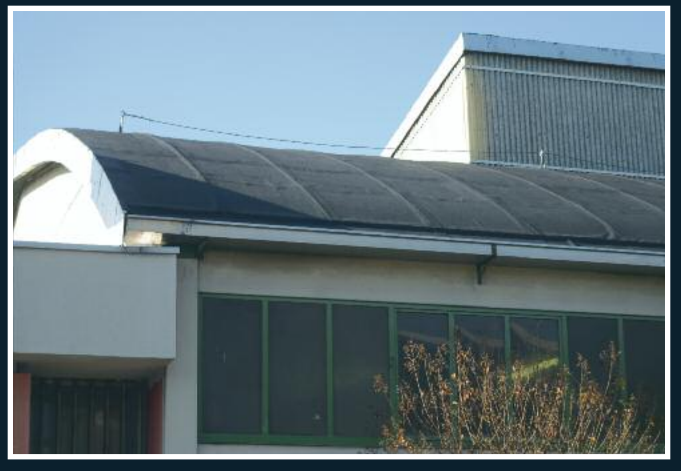
To maintain and renew old bituminous membranes