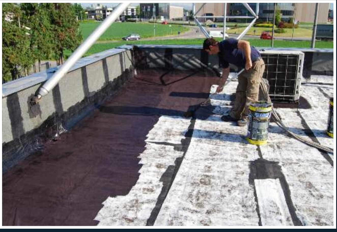
To waterproof the new or repair old bituminous membranes applying ElastiK and Supporto Antifessura (150 g/m<sup>2</sup> polyester non-woven fabric)