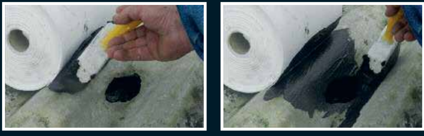
Use ElastiK to apply the Supporto Antifessura 25 cm polyester non-woven fabric