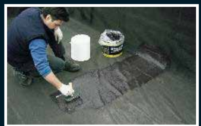
Apply the Supporto Antifessura reinforcement using only one coat of ElastiK to cover it completely. Apply a second coat of ElastiK after 24 hours.