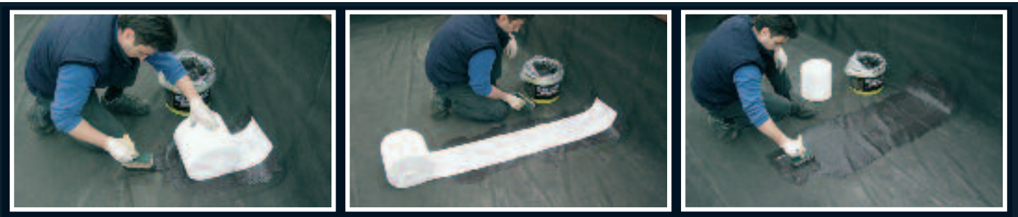
A typical example of how to repair a head joint between two sheets of bituminous membrane using a 25 cm wide roll of Supporto Antifessura.

When repairing bituminous membranes, Supporto Antifessura in 25 cm x 50 m wide rolls is required to reinforce ElastiK at the joints between the various membrane sheets.